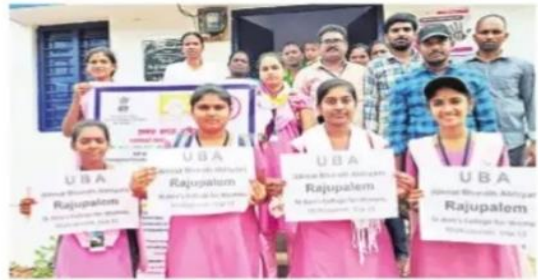
సర్వే నిర్వహించిన బృందం