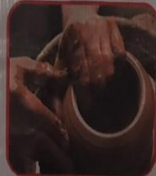
Artisans, Industries & livelihood