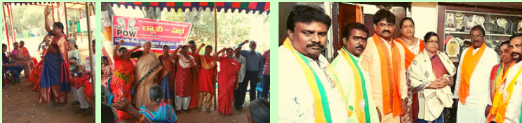
Felicitated by State BJP President

22nd March 2023- Participated in Kavi Sammelan and Ugadi celebrations organised at Branch Library, Malkapuram, Visakhapatnam.