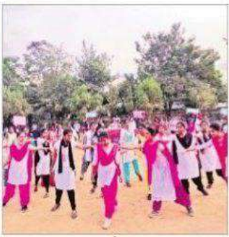
వీధి నాటకం ప్రదర్శనలో విద్యార్థినులు