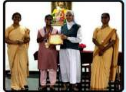
RUNNING (100Mtrs)- 1 st PRIZE, LONG JUMP - 2 nd PRIZE