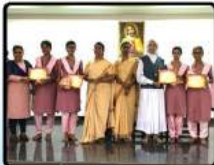
VOLLEYBALL - 2 nd PRIZE