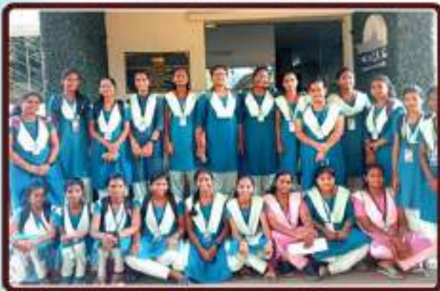
VISIT TO CENTRAL EXCELLENCE OF MARITIME UNIVERSITY