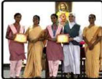
RUNNING (200Mtrs) - 2 nd & 3 rd PRIZE