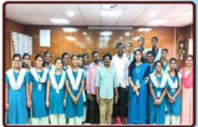
FIELD VISIT TO CMFRI - ICAR, VISAKHAPATNAM