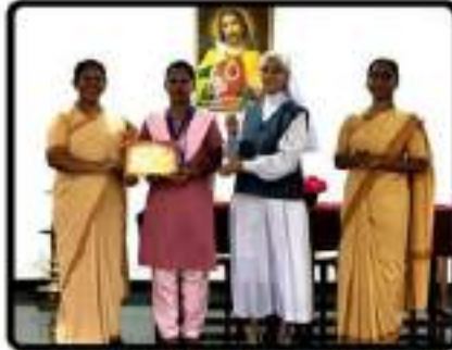
DISC THROW - 1 st PRIZE