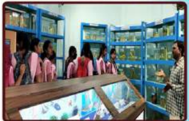
CENTRAL MARINE FISHERIES RESEARCH INSTITUTE.