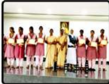
THROWBALL - 2 nd PRIZE