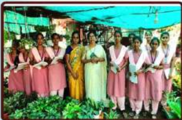
FIELD VISIT TO NURSERY