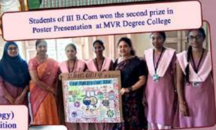
Students of III B.Com won the second prize in Poster Presentation at MVR Degree College