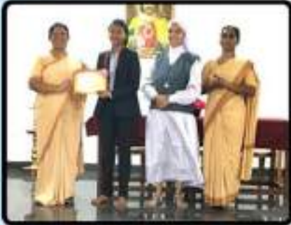
LONG JUMP - 3 rd PRIZE