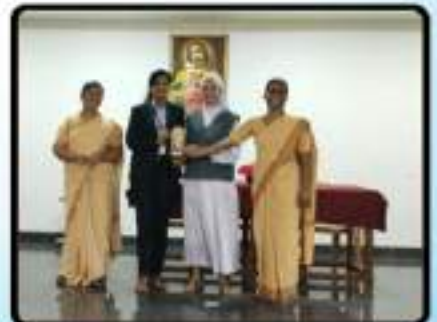
VOLLEY BALL CAPTAIN FOR UNIVERSITY TEAM