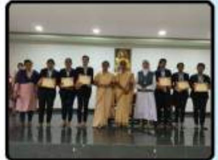
VOLLEYBALL - 1 st PRIZE