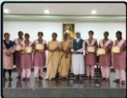
THROWBALL - 1 st PRIZE