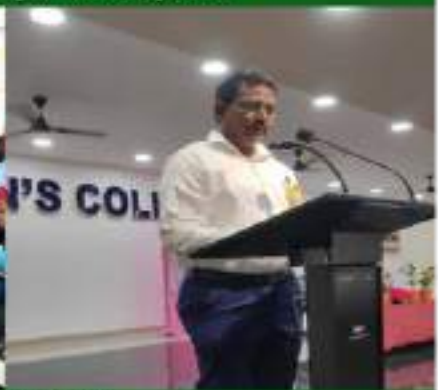
Introduction to Agnipath Scheme by Indian Navy