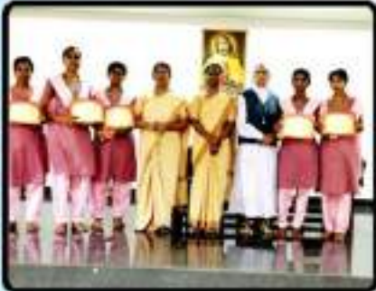
KHO KHO RUNNERS - 2 nd PRIZE