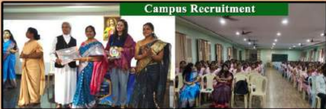
Three day workshop on Women Empowerment, Creative Thinking and Research and Personality Development