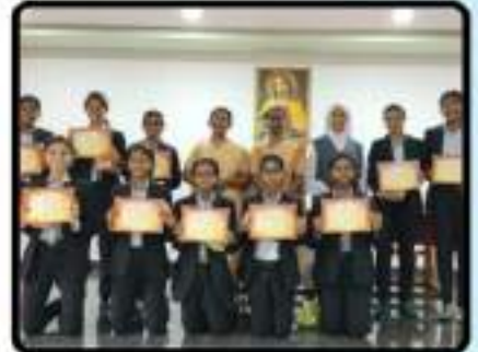
KHO KHO - 1 st PRIZE