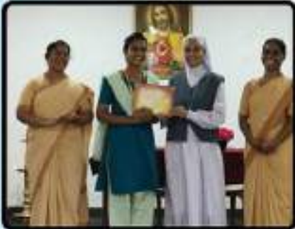
RUNNING (200MTRS) - 1 st PRIZE