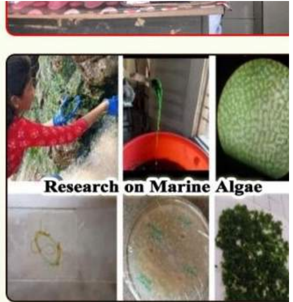
Research on Marine Algae

Working alongside experienced mentors, students can gain practical experience in their chosen field, developing research questions, designing experiments, collecting and analyzing data, and interpreting their findings. Our mentors are trained to provide students with guidance and feedback throughout the research process, ensuring that they gain a deep understanding of their subject matter and develop the skills they need to succeed in their future careers.