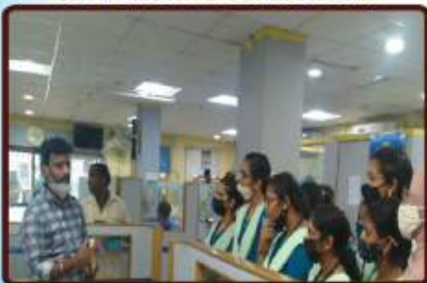
FIELD VISIT TO CANARA BANK