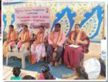
Distribution of Uniforms & T- Shirts to the poor children in Tatichetlapalem and Kancharapalem slums on 25 th Feb, 2024