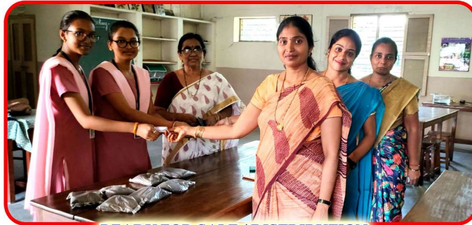
READY FOR SALE / DISTRIBUTION