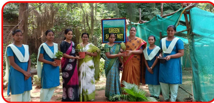
GREEN SHADE NET DEPARTMENT OF BOTANY & ZOOLOGY