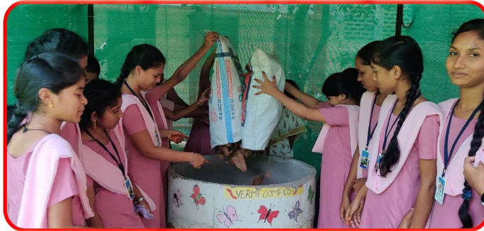
VERMI COMPOST - DEPARTMENT OF BOTANY & ZOOLOGY