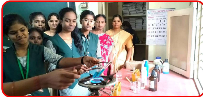
DEPARTMENT OF ZOOLOGY