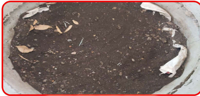
PREPARATION OF THE COMPOST