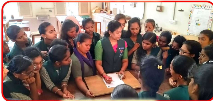
DEPARTMENT OF PHYSICS