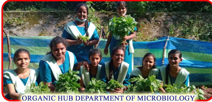
ORGANIC HUB DEPARTMENT OF MICROBIOLOGY