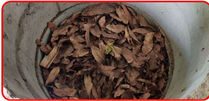
VERMI COMPOST - DEPARTMENT OF BOTANY & ZOOLOGY