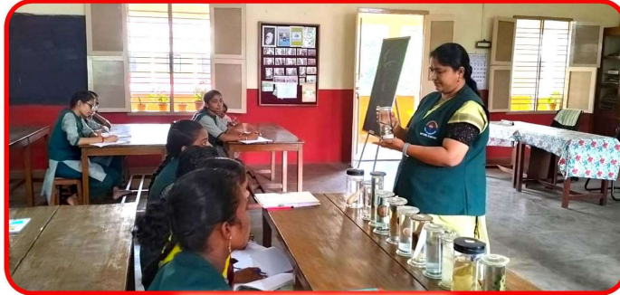
DEPARTMENT OF BOTANY

Provision of Labs for students from other colleges